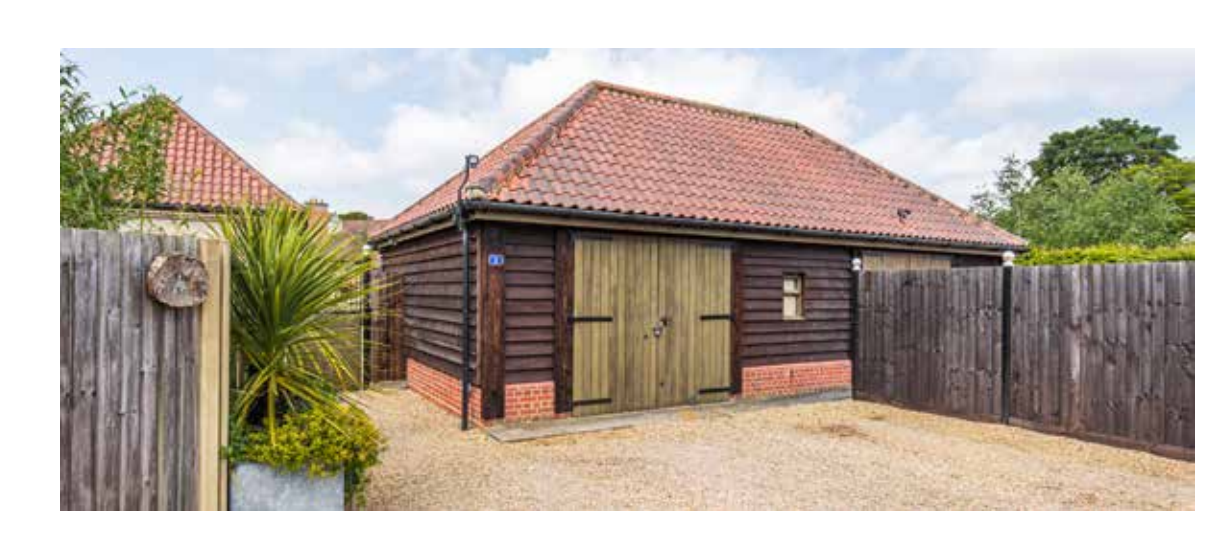
The garage/workshop at 2 Old Stables.