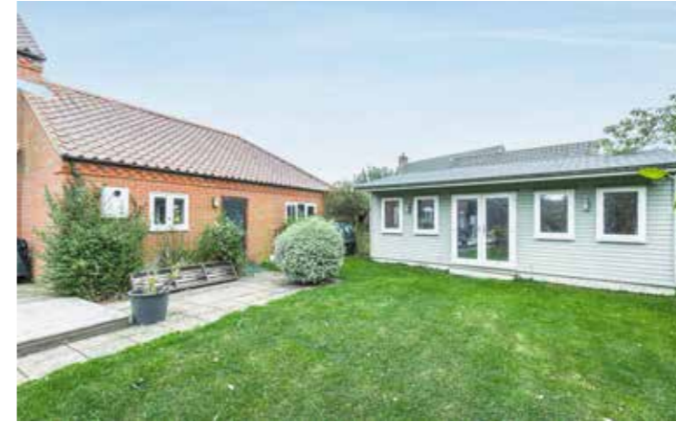
The Garden Studio

"Linton House offers a spacious retreat with beautifully landscaped gardens and separate garden studio."