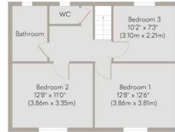
First Floor Approximate Floor Area 492 sq. ft (45.70 sq. m)