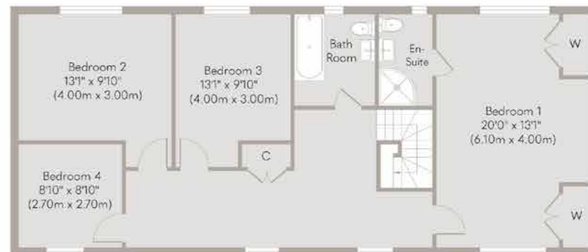
First Floor Approximate Floor Area 978 sq. ft (90.89 sq. m)

Whilst every attempt has been made to ensure the accuracy of the floor plan contained here, measurements of doors, windows, rooms and any other items are approximate and no responsibility is taken for any error, omission, or mis-statement. This plan is for illustrative purposes only and should be used as such by any prospective purchaser or tenant. The services, systems and appliances shown have not been tested and no guarantee as to their operability or efficiency can be given. Copyright V360 Ltd 2023 | www.houseviz.com