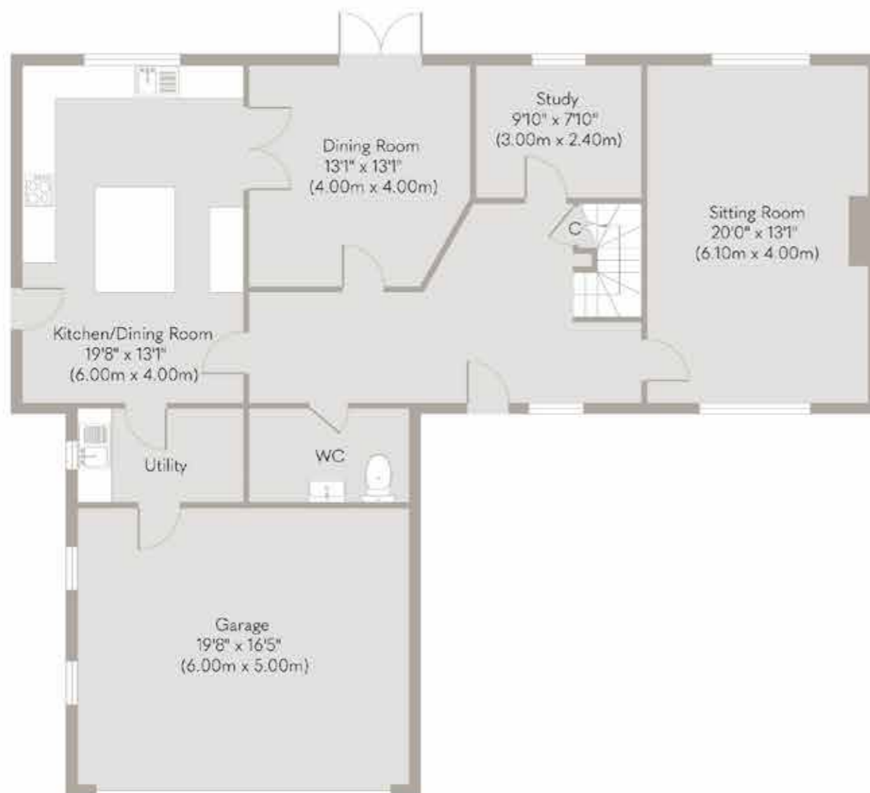
Ground Floor Approximate Floor Area 1,450 sq. ft (134.73 sq. m)