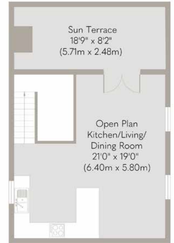
First Floor Approximate Floor Area 543 sq. ft (50.5 sq. m)

Whilst every attempt has been made to ensure the accuracy of the floor plan contained here, measurements of doors, windows, rooms and any other items are approximate and no responsibility is taken for any error, omission, or mis-statement. This plan is for illustrative purposes only and should be used as such by any prospective purchaser or tenant. The services, systems and appliances shown have not been tested and no guarantee as to their operability or efficiency can be given.