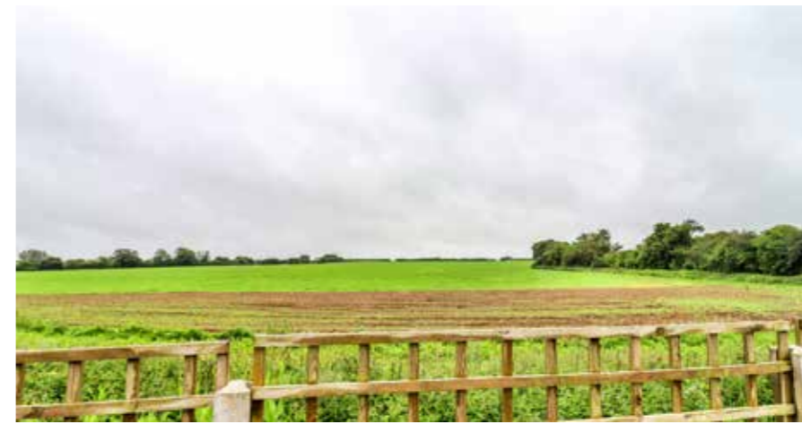
Countryside view from Quarteracre.

“The uninterrupted scenery is very uplifting”