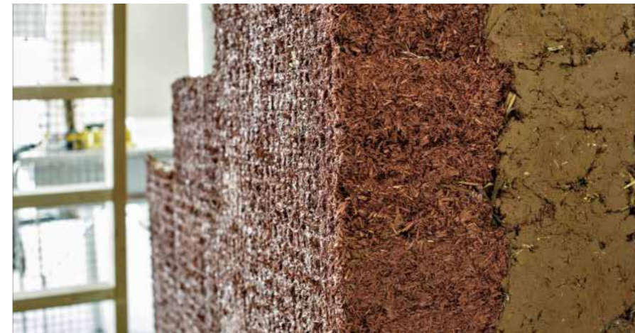
The world's first CobBauge home, Fakenham.

“Building Norfolk – our pledge to protect the environment for future generations.”