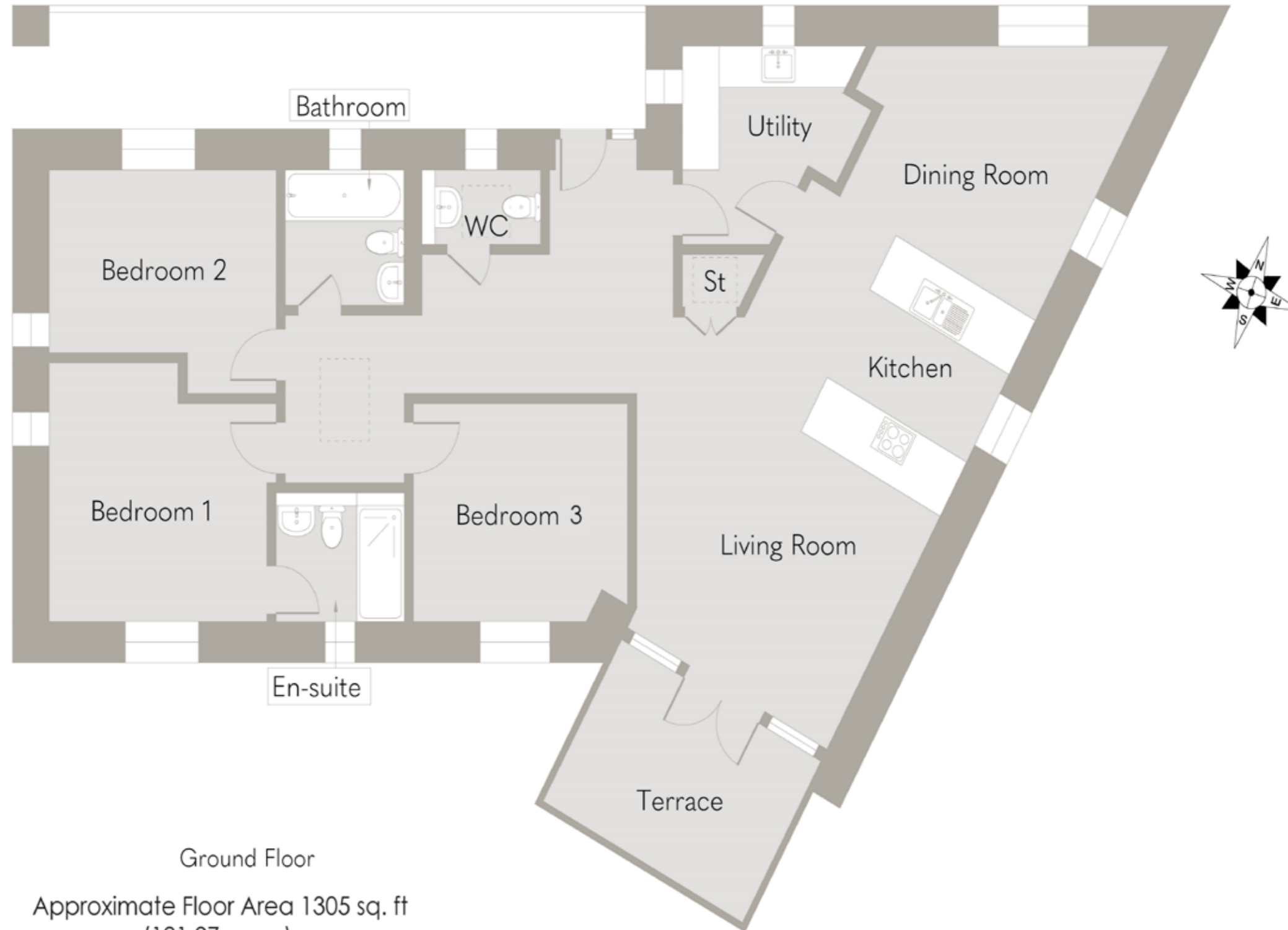
Ground Floor Approximate Floor Area 1305 sq. ft (121.27 sq. m)

Whilst every attempt has been made to ensure the accuracy of the floor plan contained here, measurements of doors, windows, rooms and any other items are approximate and no responsibility is taken for any error, omission, or mis-statement. This plan is for illustrative purposes only and should be used as such by any prospective purchaser or tenant. The services, systems and appliances shown have not been tested and no guarantee as to their operability or efficiency can be given.