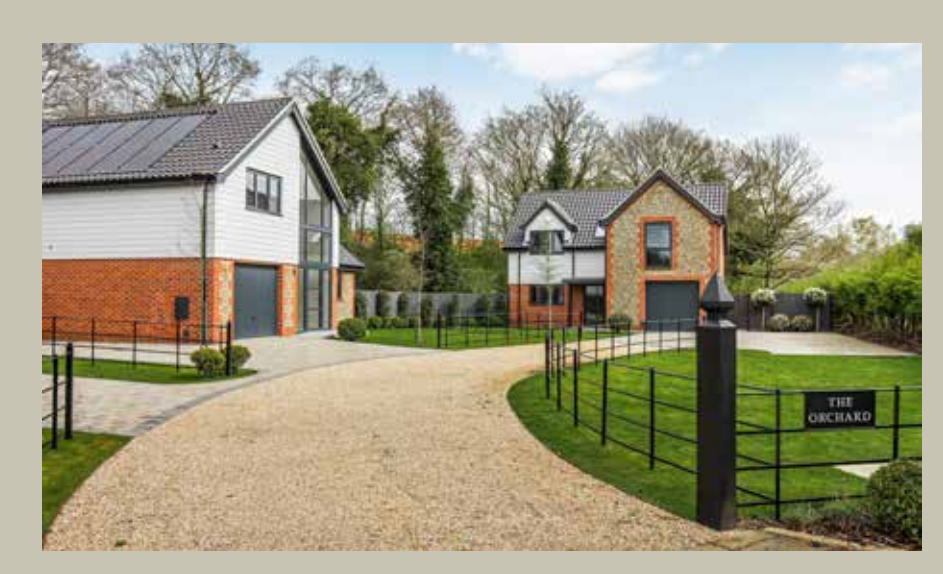
Homes at The Orchard

A brilliant location, exquisite properties waiting to be rediscovered and a growing band of entrepreneurial businesses, Fakenham is enjoying a renaissance and offers a superb place to call home.