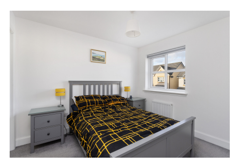
3 Bed | 3 Bath | 87m2