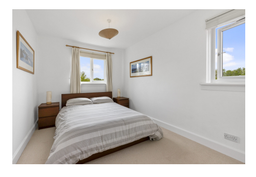
4 Bed | 3 Bath | 124m2