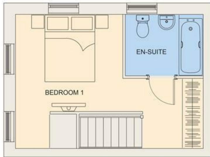
Floor Plan | Second Floor