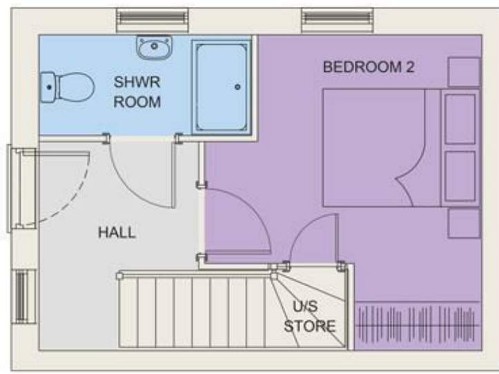
Floor Plan | Ground Floor