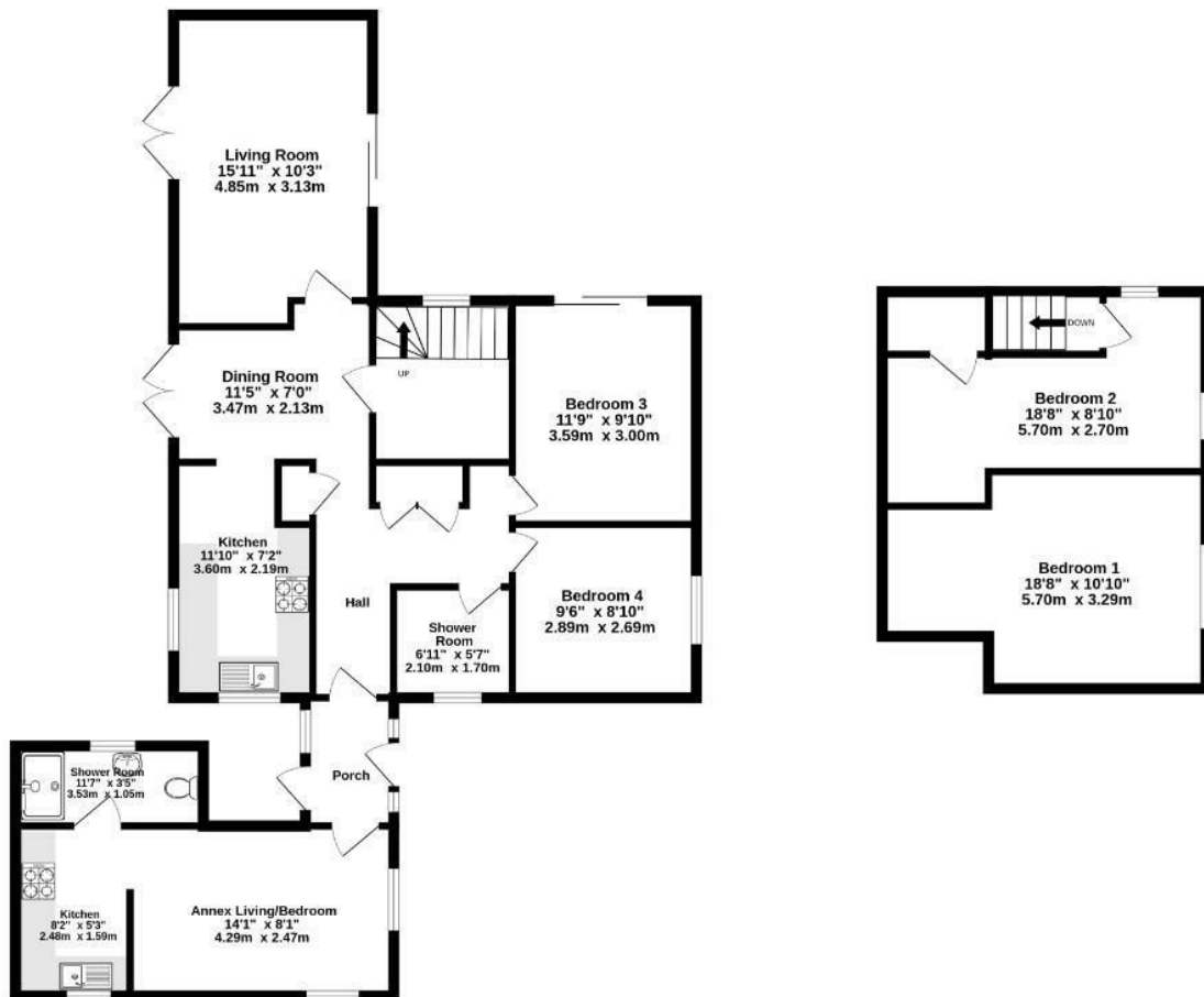
THORNBECK AVENUE, HIGHTOWN

While every attempt is made to ensure the accuracy of this floorplan, measurements are approximate only and no responsibility is accepted by Metroppx ©2023 in relation to any error, omission or mis-statement. The plan is for illustrative purposes only and should be used as such by any prospective purchaser. Made with Metroppx ©2023