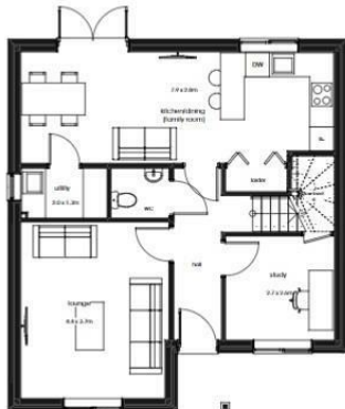
ground floor plan