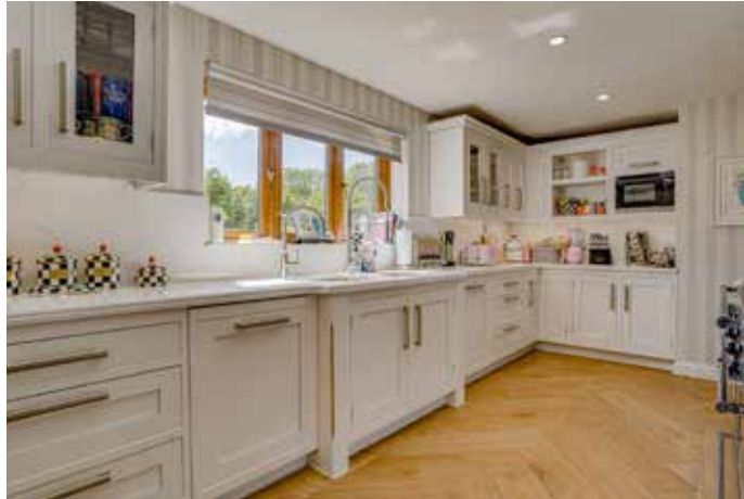
Charter House, 6 Cawtes Reach, Warsash, Southampton, SO31 9EA