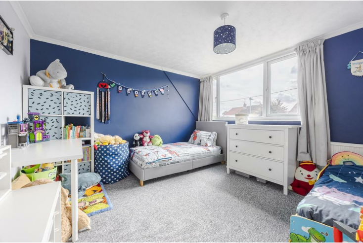
Bedroom Two 10'9" x 11'1" (3.30 x 3.40)