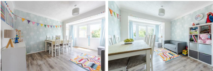
Dining Room 11'5" x 11'3" (3.48 x 3.45)