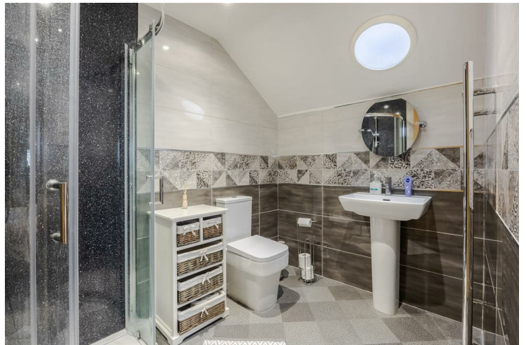
Bedroom One En Suite 5'5" x 6'8" (1.66 x 2.05)