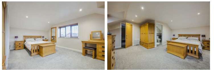
Bedroom One 13'10" x 10'6" (4.22 x 3.22)