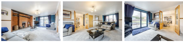
Lounge 19'8" x 11'7" (6.01 x 3.55)