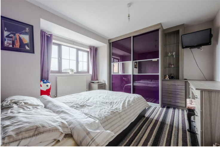
Bedroom Three 9'9" x 11'7" (2.98 x 3.54)