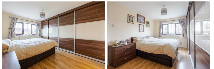
Bedroom Two 17'2" x 16'10" (5.25 x 5.14)