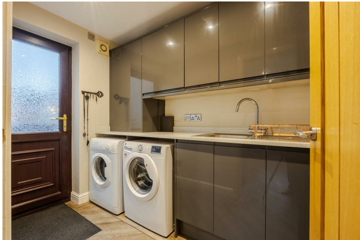
Utility Room 5'5" x 8'8" (1.66 x 2.66)