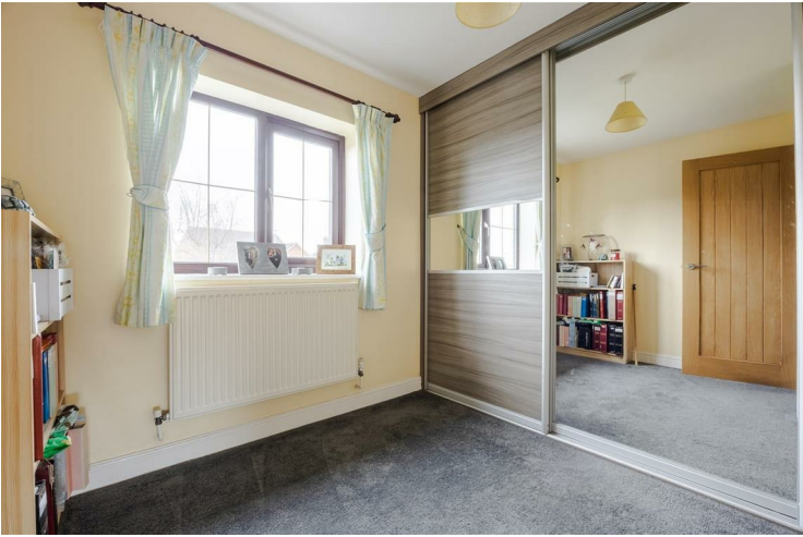
Bedroom Five 9'9" x 10'1" (2.98 x 3.09)