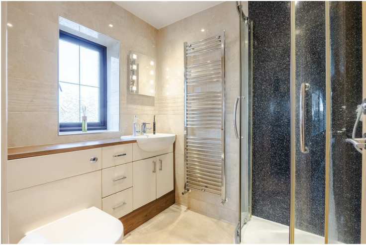
Bedroom Two En Suite 5'8" x 7'11" (1.75 x 2.42)