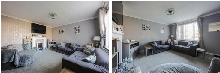
Lounge 12'3" x 11'11" (3.75 x 3.64)