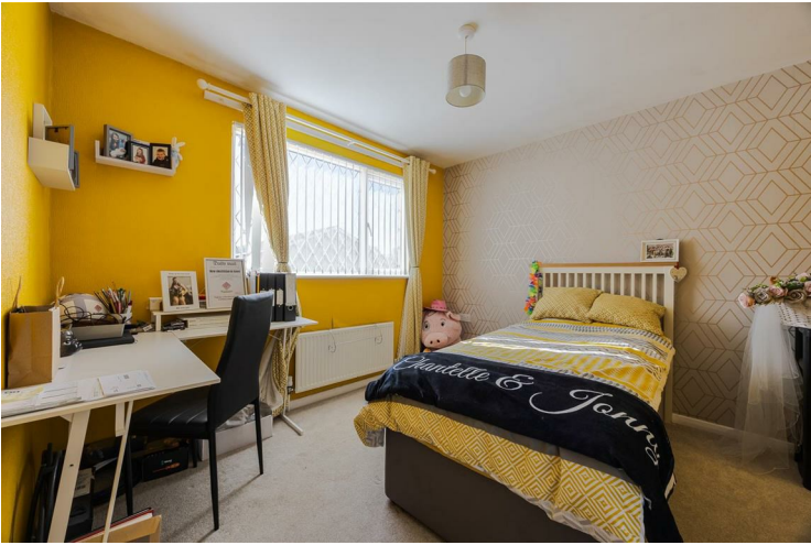
Bedroom two 11'5" x 9'10" (3.50 x 3.01)