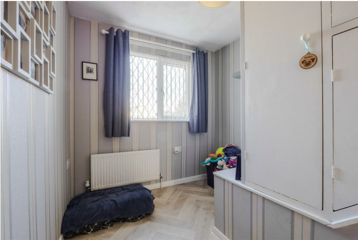
Bedroom three 9'4" x 7'5" (2.87 x 2.27)