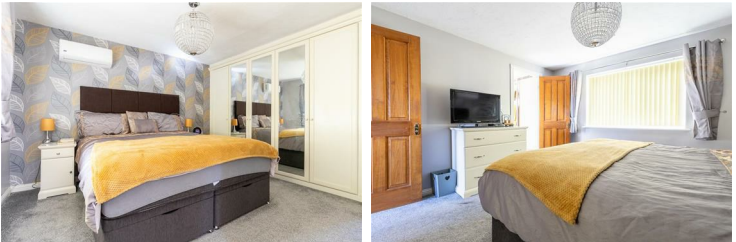
Bedroom One 11'5" x 12'0" (3.49 x 3.66)