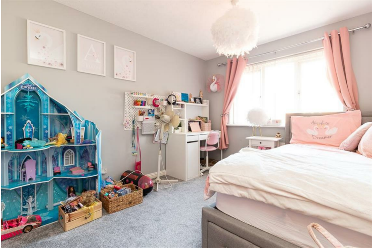
Bedroom Two 12'0" x 8'11" (3.66 x 2.74)