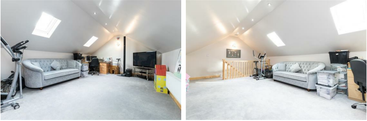
Garage Loft Space 21'9" x 12'9" (6.65 x 3.90)