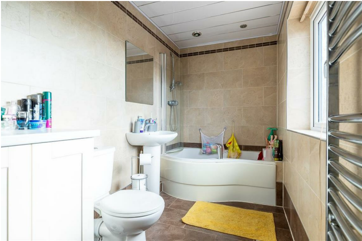
En Suite 11'6" x 5'1" (3.51 x 1.56)