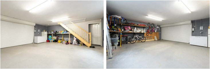
Double Garage 22'3" x 20'3" (6.79 x 6.18)