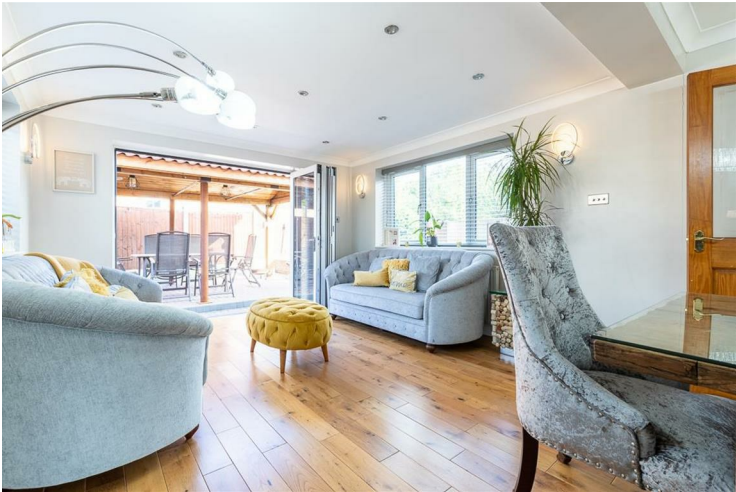
Dining Area & Sun Room 21'9" x 11'11" (6.63 x 3.65)