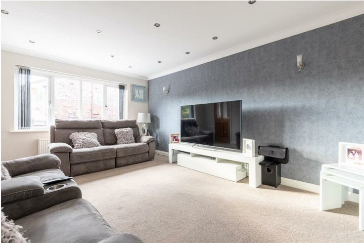
Lounge 16'6" x 11'11" (5.04 x 3.65)