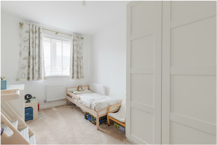
Bedroom two 12'5" x 7'2" (3.81 x 2.20)