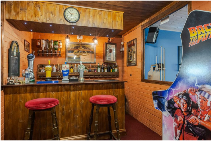
Seating area 9'9" x 7'6" (2.99 x 2.30)