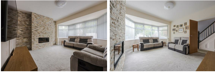
Lounge 14'3" x 13'0" (4.36 x 3.97)

The lounge benefits from an inset wave flame gas fire.