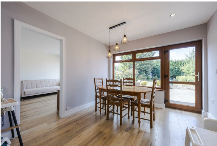
Dining area 10'11" x 10'0" (3.35 x 3.07)