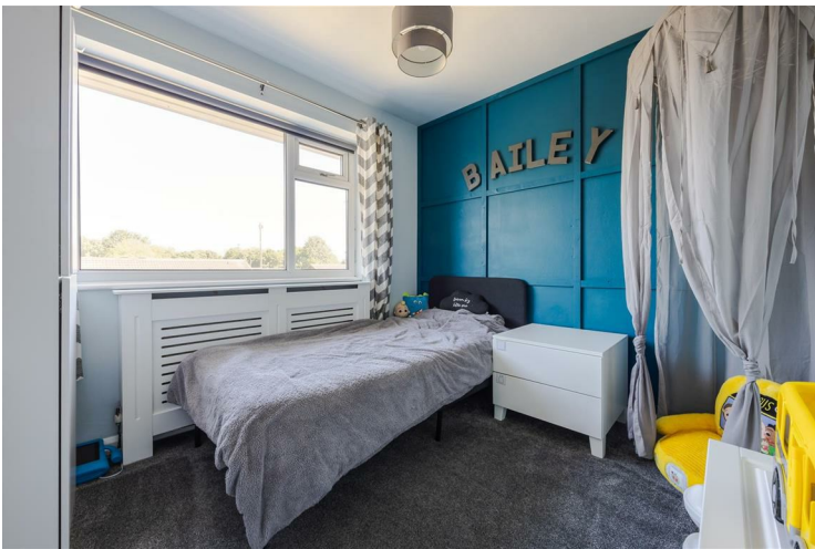
Bedroom two 8'8" x 9'8" (2.65 x 2.95)