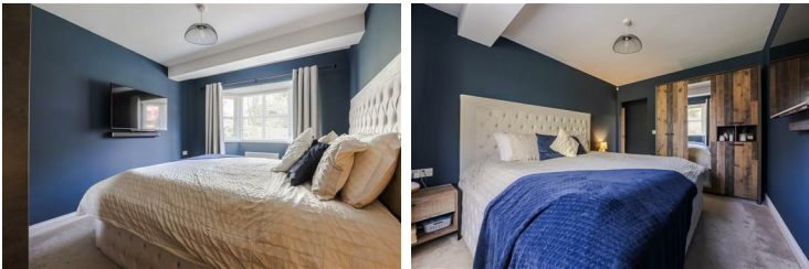
Bedroom one 12'8" x 9'10" (3.88 x 3.02)