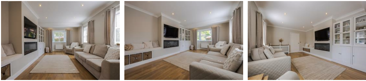
Lounge 18'0" x 11'11" (5.49 x 3.64)