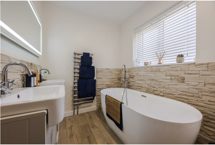
En suite 8'7" x 6'5" (2.62 x 1.97)