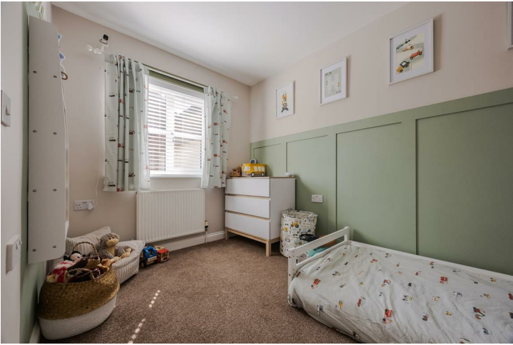
Bedroom four 7'7" x 11'11" (2.33 x 3.64)