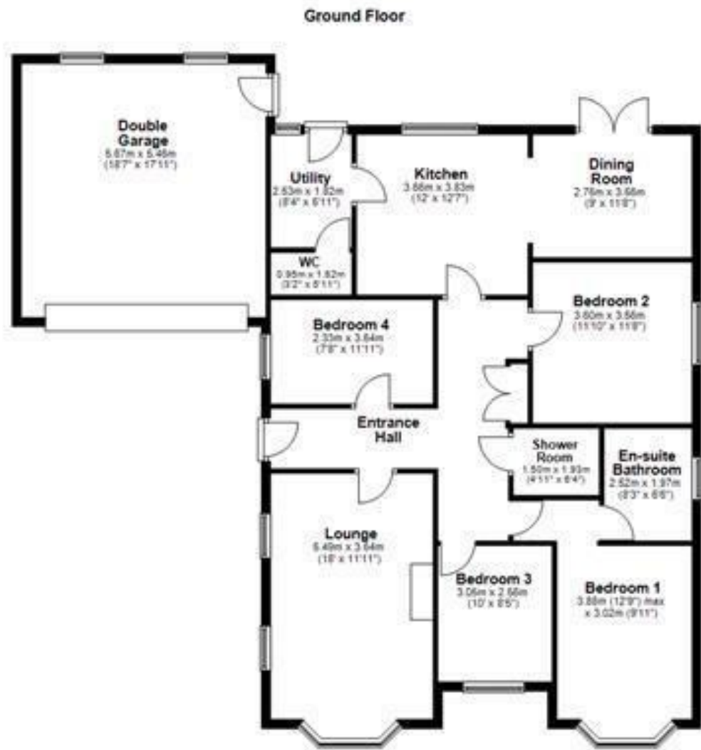
Total area: approx. 152.8 sq. metres (1645.2 sq. feet)