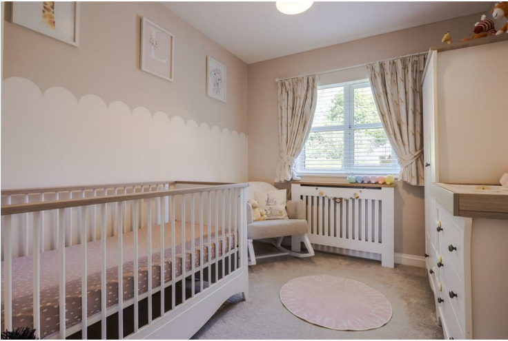
Bedroom three 10'0" x 8'9" (3.05 x 2.68)