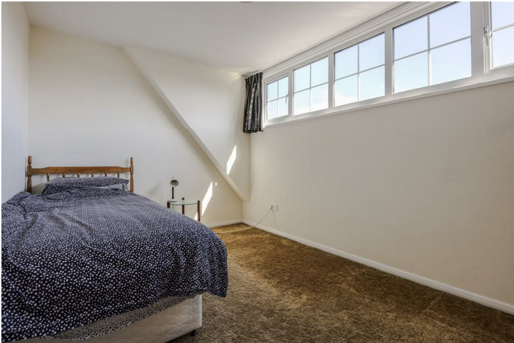
Bedroom three 12'2" x 8'6" (3.71 x 2.60)