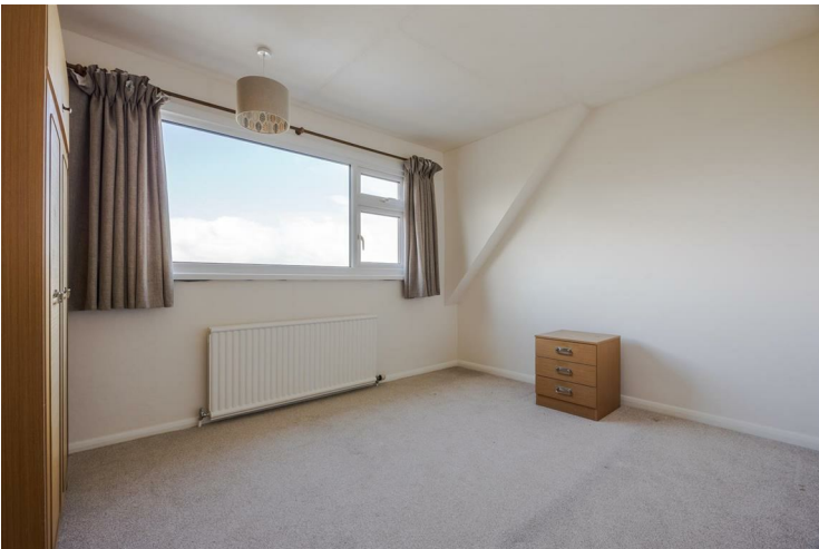
Bedroom two 13'8" x 10'4" (4.18 x 3.16)