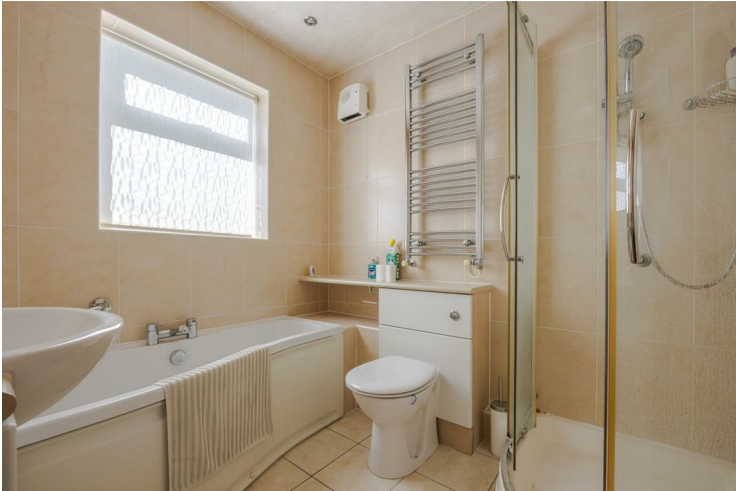
Bathroom 7'3" x 6'10" (2.23 x 2.09)