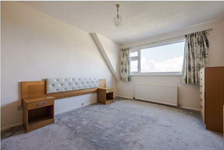
Bedroom one 12'11" x 10'11" (3.96 x 3.34)