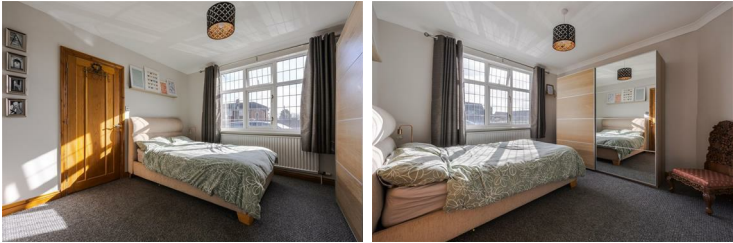
Bedroom Two 12'5" x 11'9" (3.80 x 3.60)