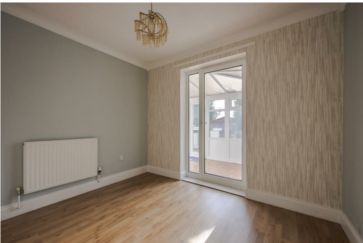
Conservatory 17'6" x 6'3" (5.34 x 1.91)