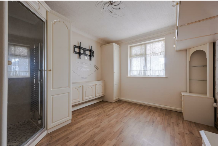
Bedroom two 9'10" x 8'4" (3.02 x 2.56)