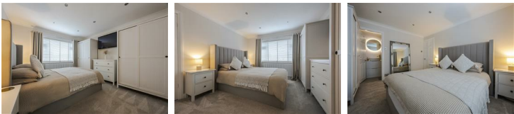
Bedroom one 12'5" x 10'11" (3.79 x 3.35)