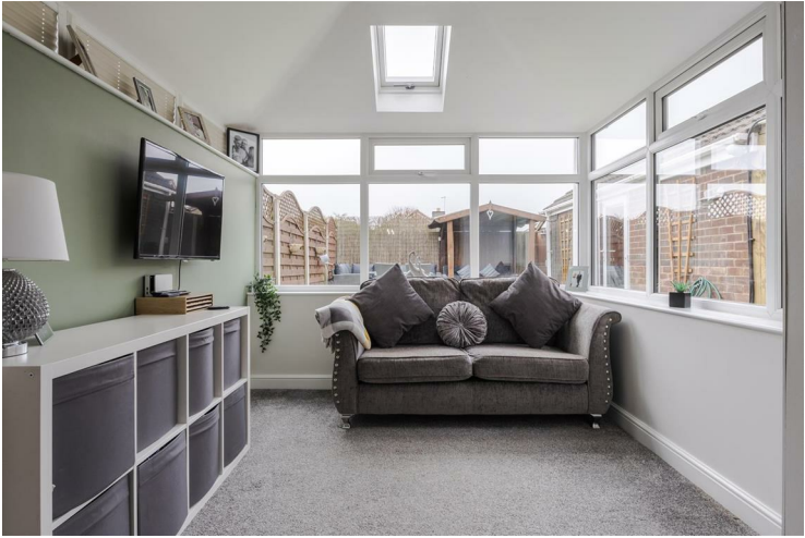
Sun room 9'6" x 9'0" (2.91 x 2.76)