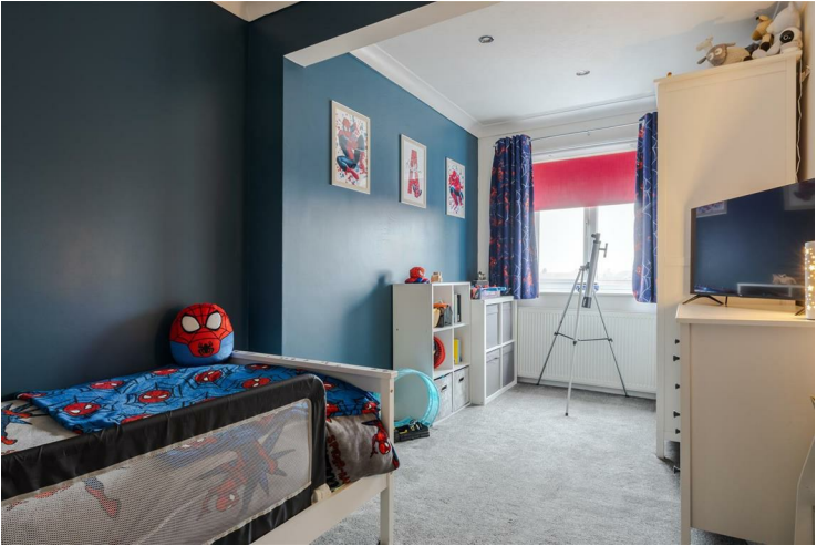
Bedroom two 14'9" x 7'8" (4.51 x 2.36)