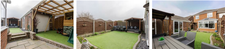
Bar 12'7" x 9'4" (3.85 x 2.87)