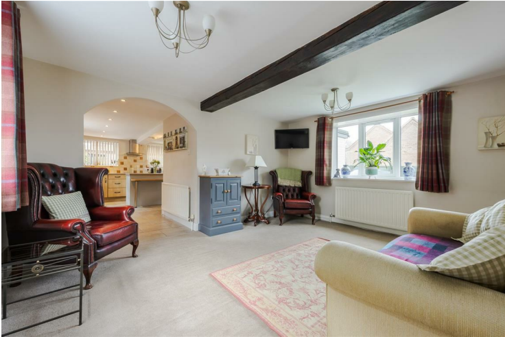
Dining room 14'3" x 12'1" (4.36 x 3.69)