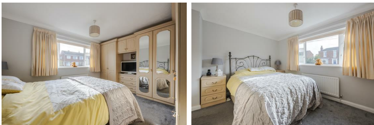
Bedroom one 12'11" x 10'9" (3.95 x 3.29)