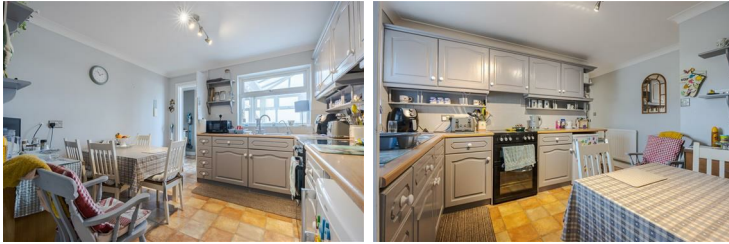
Dining room 11'0" x 9'11" (3.36 x 3.04)