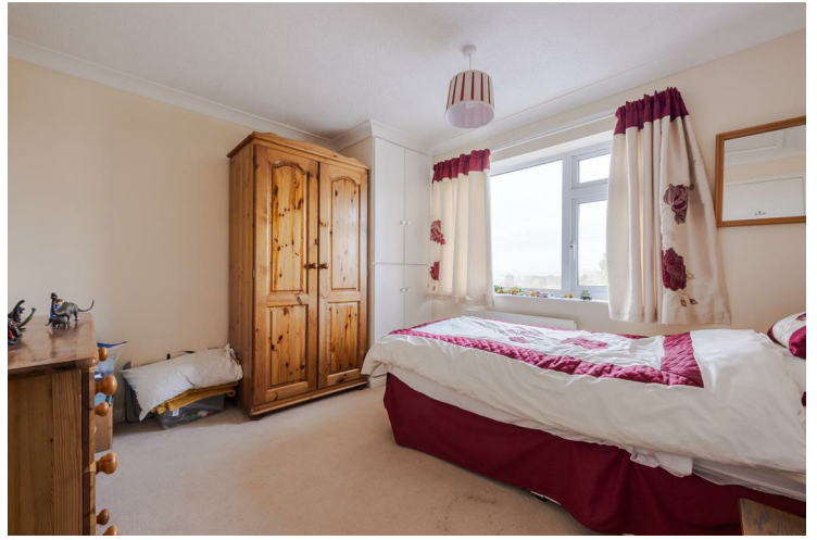
Bedroom three 9'11" x 9'8" (3.04 x 2.95)