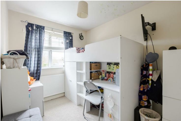
Bedroom Four 9'11" x 7'5" (3.03 x 2.27)