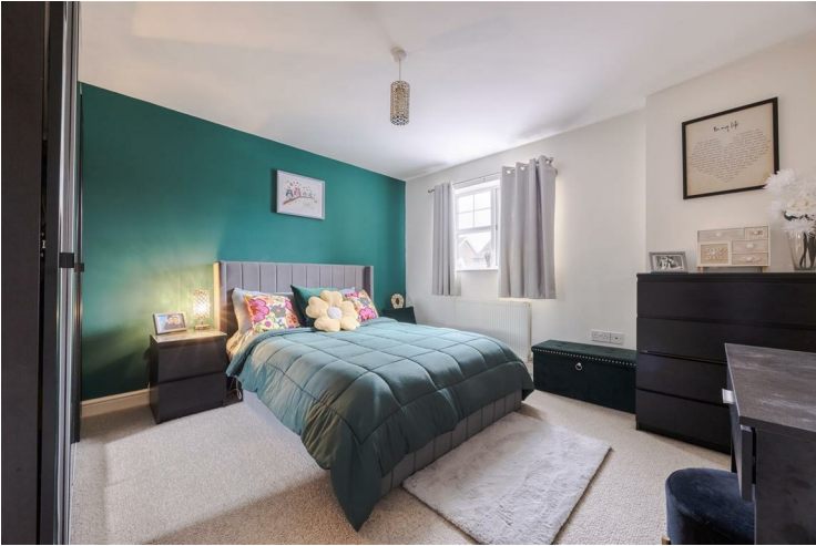
Bedroom Two 12'5" x 11'5" (3.80 x 3.49)