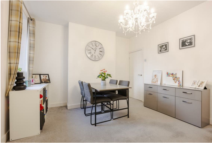
Dining room 11'10" x 12'8" (3.61 x 3.87)