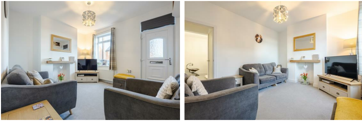
Lounge 10'7" x 12'9" (3.25 x 3.89)