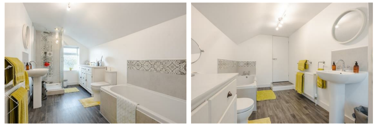
Bathroom 13'10" x 6'11" (4.24 x 2.13)