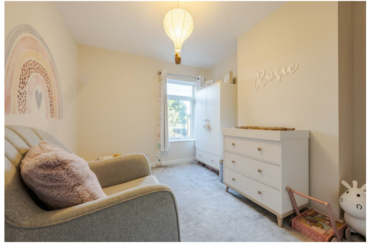
Bedroom two 11'9" x 9'8" (3.60 x 2.96)