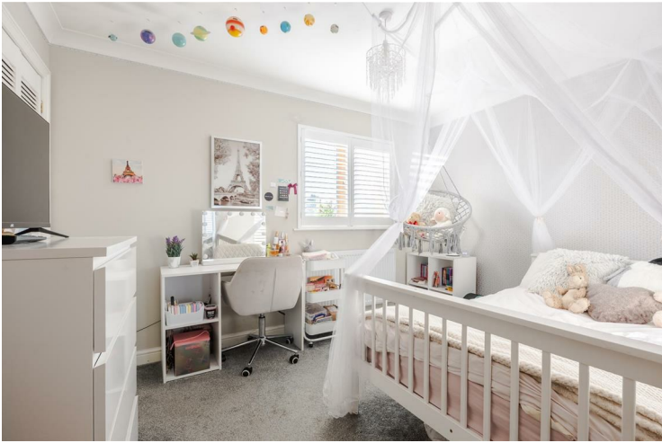
Bedroom four 9'10" x 7'0" (3.02 x 2.15)