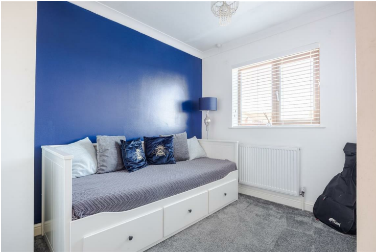
Bedroom five 6'6" x 8'0" (1.99 x 2.45)