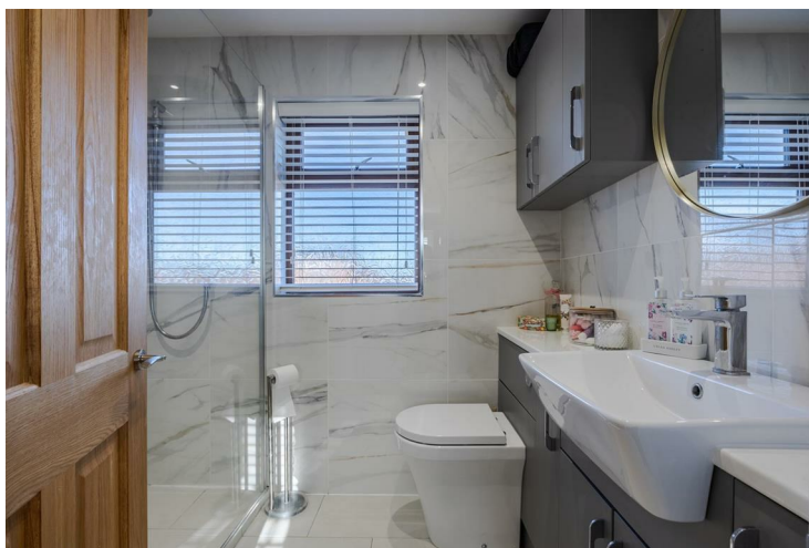
En-suite 5'5" x 7'7" (1.66 x 2.33)