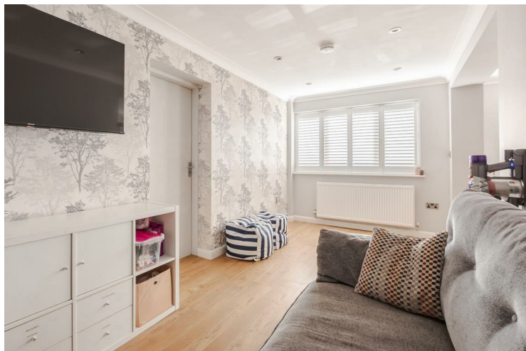
Sitting room 16'7" x 9'11" (5.08 x 3.03)