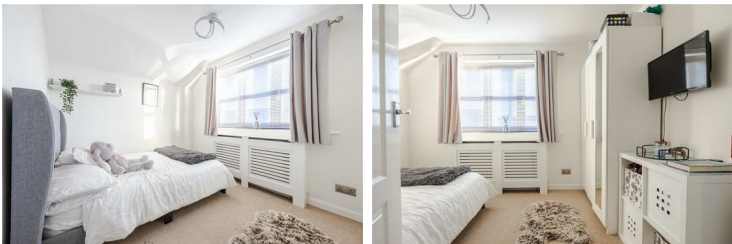
Bedroom Three 8'5" x 8'4" (2.57 x 2.55)