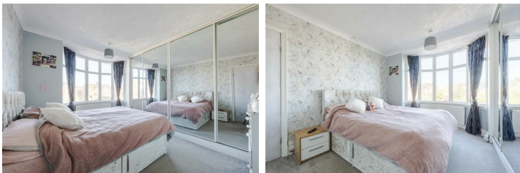
Bedroom One 11'1" x 11'5" (3.40 x 3.50)