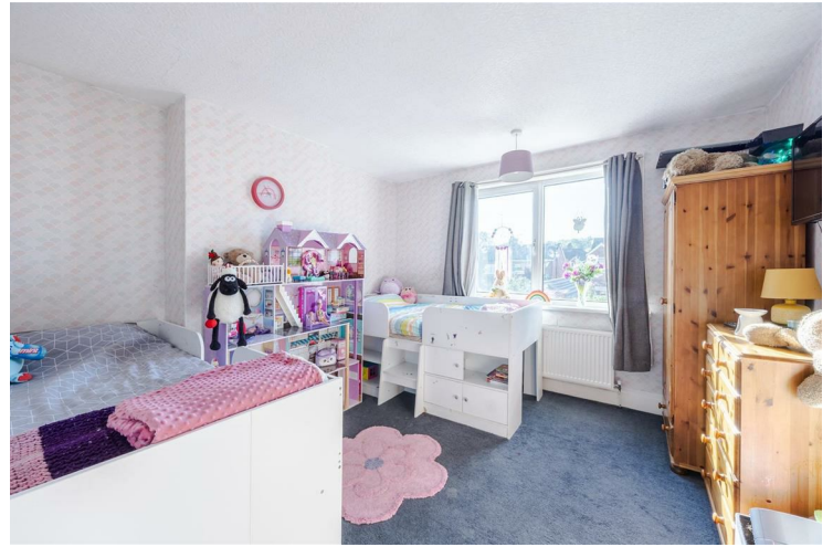
Bedroom Three 6'2" x 6'8" (1.90 x 2.04)