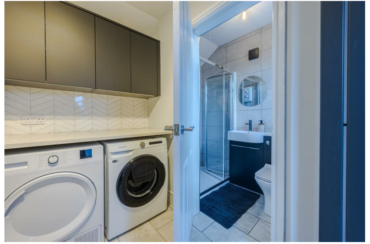
Utility 4'6" x 7'3" (1.39 x 2.22)