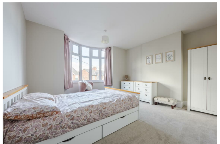
Bedroom one 11'9" x 12'11" (3.60 x 3.94)