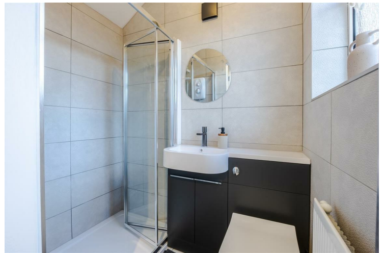
Shower room 3'9" x 5'11" (1.16 x 1.81)