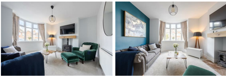
Lounge 11'8" x 12'11" (3.57 x 3.94)