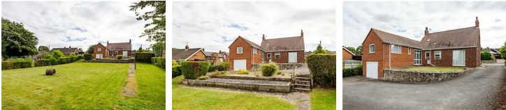
Garage 16'0" max x 12'9" (4.89 max x 3.89)