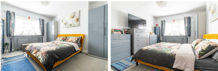
Bedroom one 14'0" x 12'7" (4.27 x 3.85 )