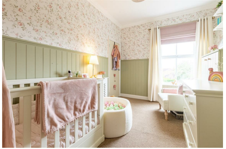
Bedroom three 7'5" x 9'1" (2.28 x 2.79)