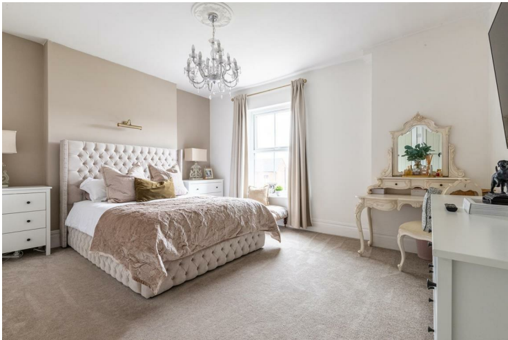
Bedroom one 13'7" x 16'0" (4.16 x 4.90)