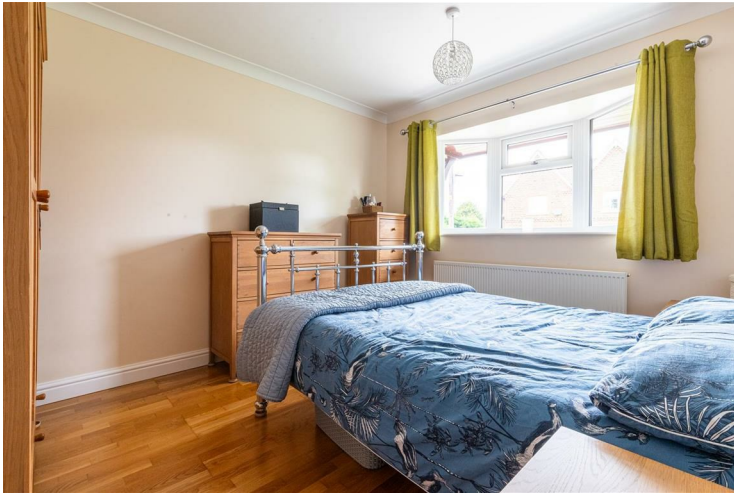
Bedroom one 11'5" x 10'1" (3.50 x 3.09 )