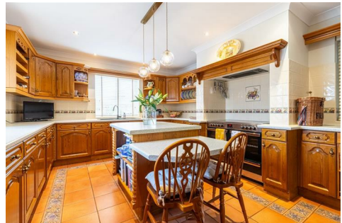
Bridge House, 3 Millers Brook, Doncaster, DN9 1WA