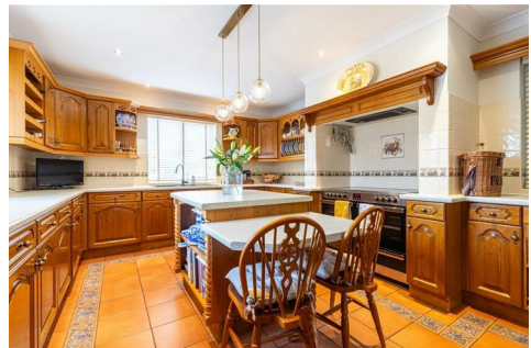
Bridge House, 3 Millers Brook, Doncaster, DN9 1WA £420,000

Bridge House is a unique four bedroom family home. Built in 1998 to a high calibre, this home has some beautiful character features within it, setting it apart from a lot of modern build homes. The vaulted main bedroom with Juliette balcony, walk in wardrobe and en suite, alongside the spacious lounge and feature inglenook fireplace are just two highlights. The house has also been extended with the addition of the dining room, again vaulted with doors out to the private garden. Outside the plot is excellent with a double garage, access to the side (potential for caravan hardstanding) and a secure private back garden with multiple seating areas. Viewings are available by appointment, please contact us to book or for more information.