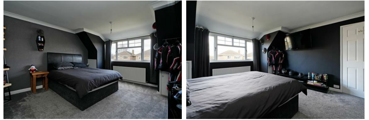
Bedroom Three 8'8" x 11'8" (2.66 x 3.57)