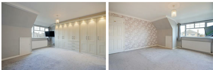
Bedroom One 14'1" x 15'4" (4.30 x 4.68)