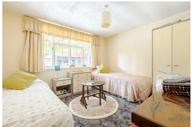
Bedroom Two 9'6" x 12'0" (2.92 x 3.67)