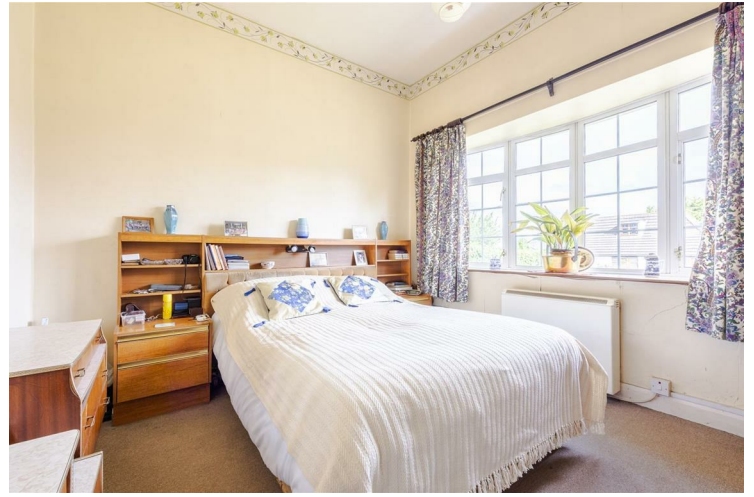
Bedroom Two 9'6" x 12'0" (2.92 x 3.67)