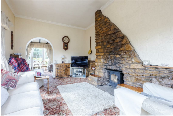
Lounge 15'11" x 12'9" (4.87 x 3.89)