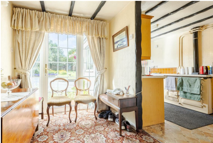
Dining area 6'6" x 6'7" (2.00 x 2.01)