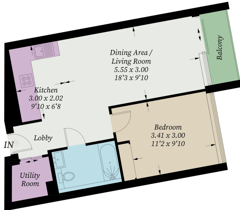
Illustration for identification purposes only, measurements are approximate, not to scale. Fourlabs.co © (ID1263206)

Approximate Gross Internal Area = 48.8 sq m / 525 sq ft