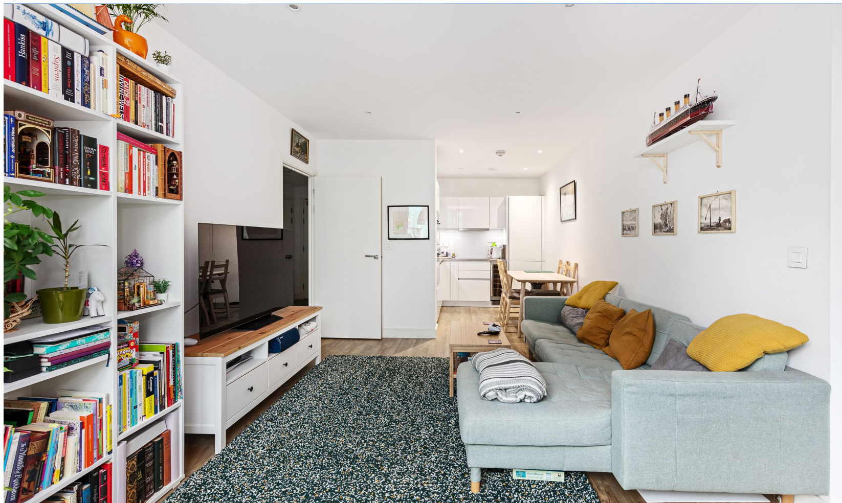
Lariat Apartments, 36 Cable Walk, Greenwich, London SE10 0TR