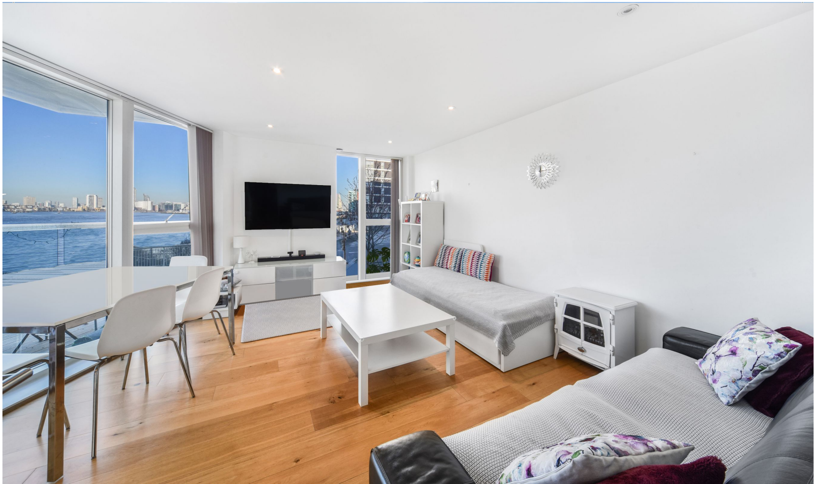
Henry Hudson Apartments, 41 Banning Street, Greenwich SE10 0FE