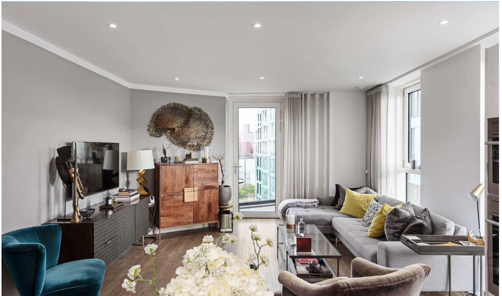
Lariat Apartments, 36 Cable Walk, Greenwich, London, SE10 0TR