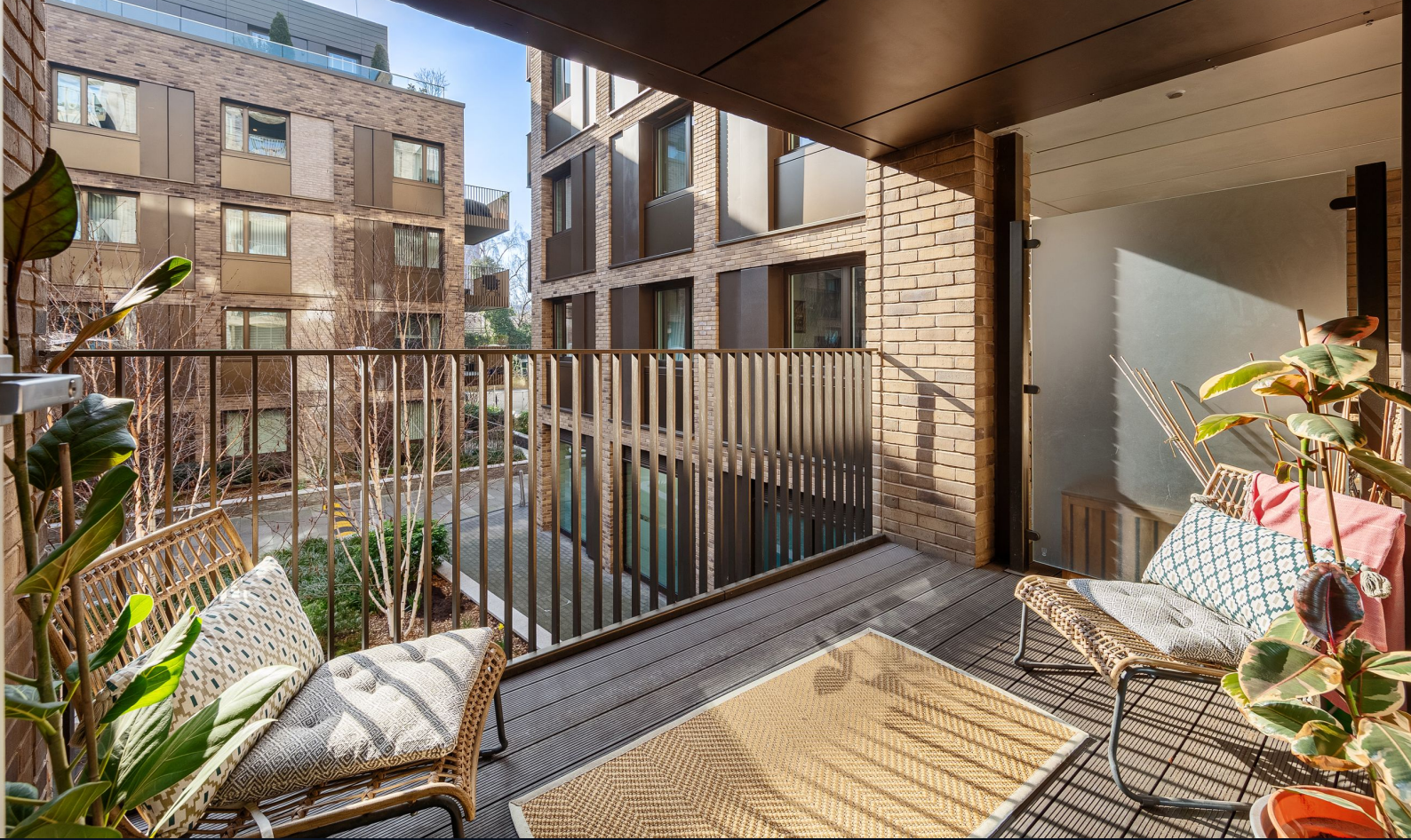
Molten Court, Moulding Lane, London, SE14 6FA