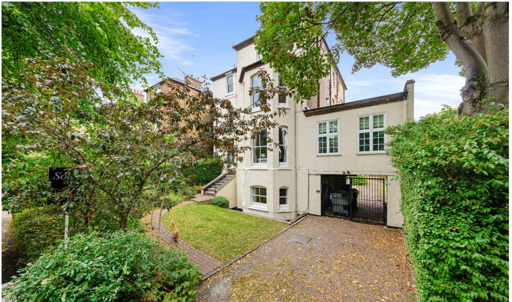
Ringwood Court, 24 Kidbrooke Grove, Blackheath, SE3 0LF