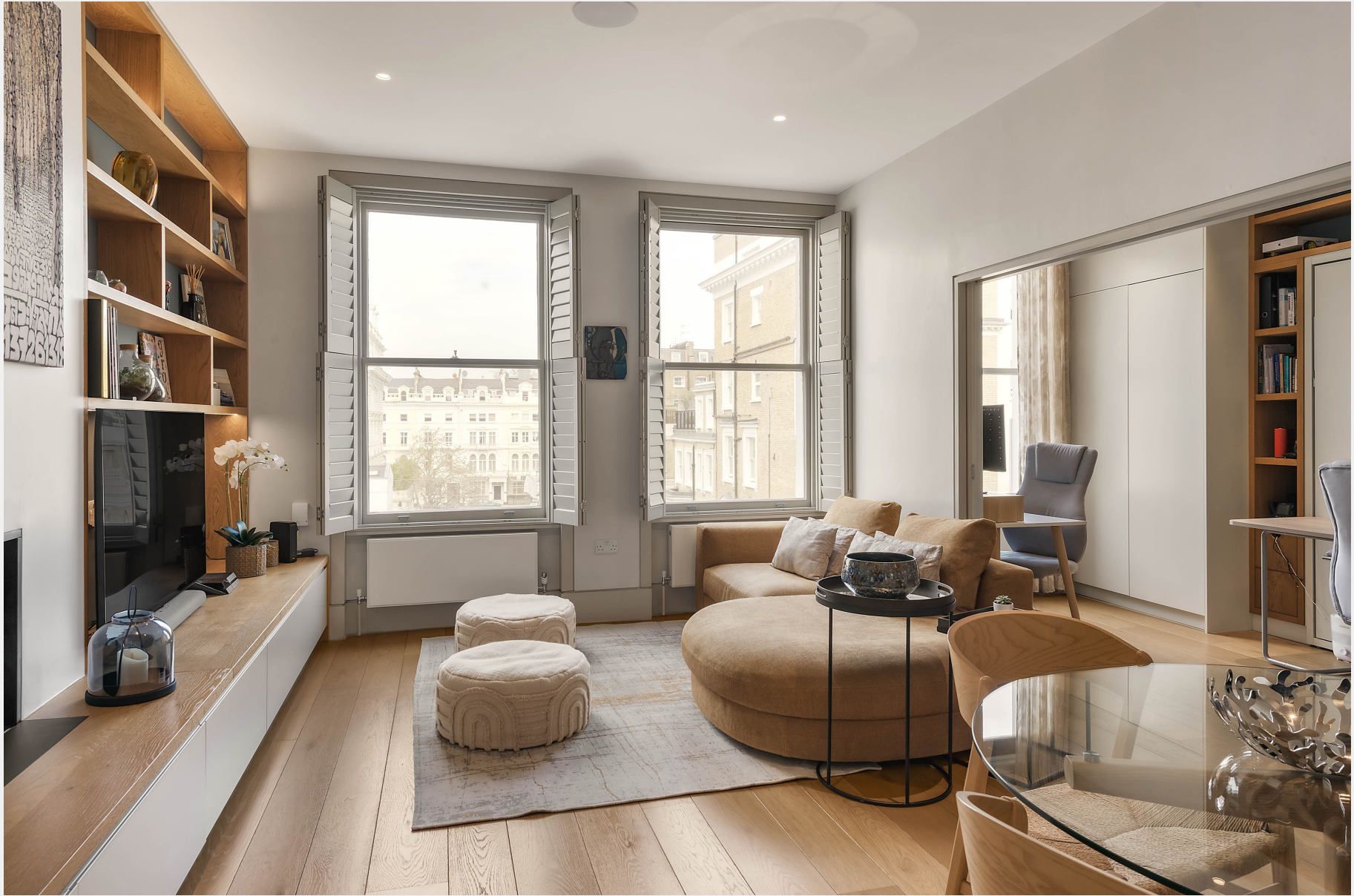
ELVASTON PLACE | SOUTH KENSINGTON SW7